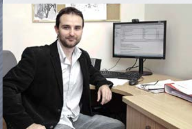
SINGLE POINT OF CONTACT

For effective co-operation Protea assigns a dedicated project manager.