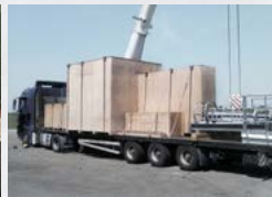
PACKING & TRANSPORTATION