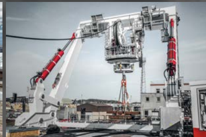
MECHANICAL HANDLING SYSTEMS