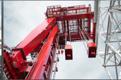
BOP HANDLING EQUIPMENT