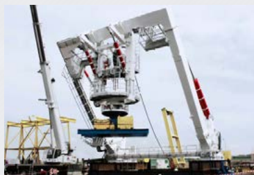
FUNCTIONAL & LOAD TESTS

Protea fabricates in-house to ensure high quality and control costs.